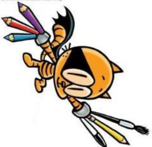
CAT KID COMC CLUB

Can't make it to the Book Fair this year or have non-local family or friends who would like to make a purchase from our fair? Shop the Book Fair online at https://www.scholastic.com/bf/helenhallerementaryschool1 from Nov 13th-Nov. 26th.